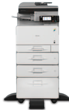
MP C305 with two optional PB1050 Paper Trays